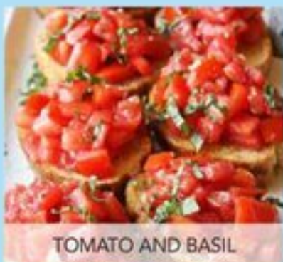
TOMATO AND BASIL