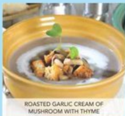
ROASTED GARLIC CREAM OF MUSHROOM WITH THYME

MINISTRONE 225 Classic Italian Chunky Vegetables & Pasta Soup