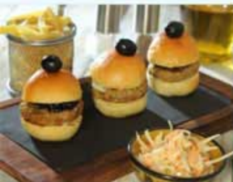
JERK LAMB BUN