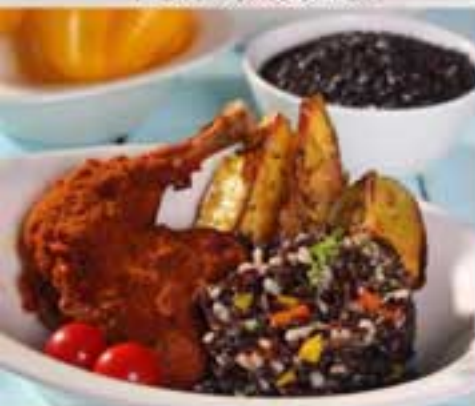
SALMON EN PAPILOTTE

Peri Peri Chicken Thigh, Jakhiya Seeds , West Bengal Black Rice