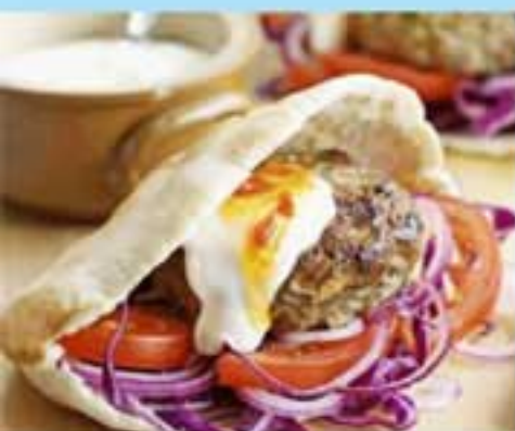
VEG KOFTA KEBAB