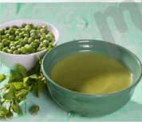
GREEN PEA AND MINT