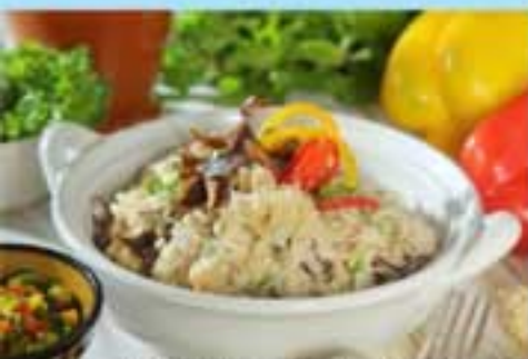
WILD MUSHROOM RISOTTO