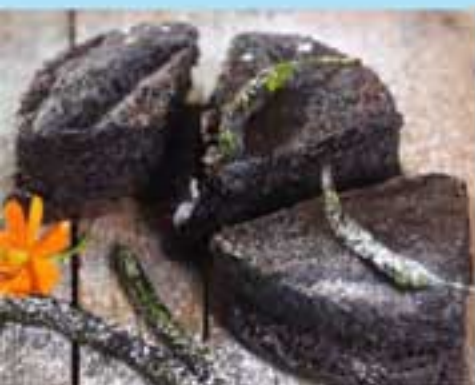
NEW YORK CHEESE CAKE • Salted Caramel