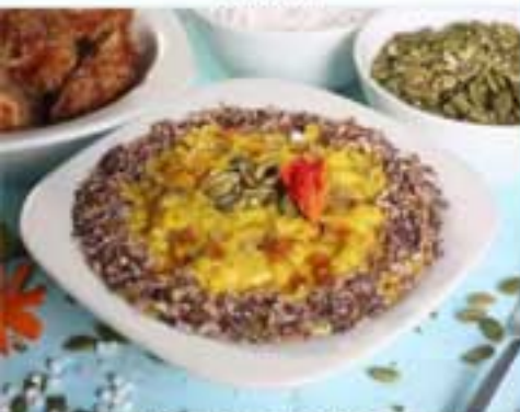
TIRAMISU • Savoir de biscuit