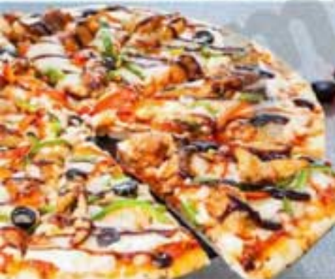
PERI PERI CHICKEN