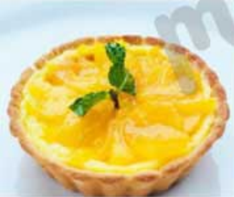
TART • With Cherries, Custard