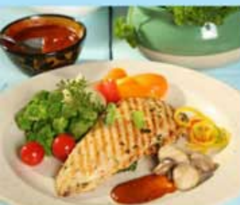
VENETIAN CHICKEN STEAK