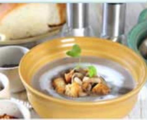
ROASTED GARLIC CREAM OF MUSHROOM WITH THYME