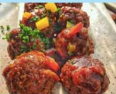
OVEN BAKED SPICY MEATBALLS