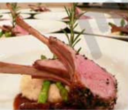
GRILLED PORK CHOP