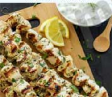
GRILLED MEDITERRANEAN KEBAB WITH PITA