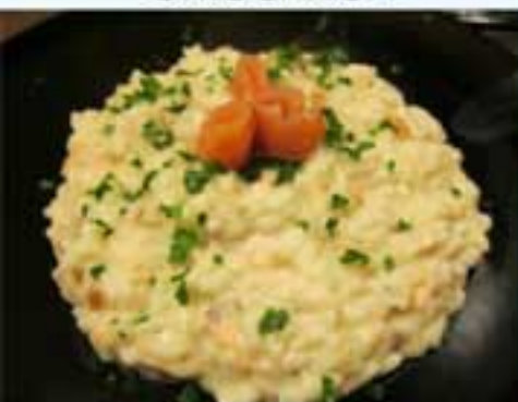
RISOTTO FRUTTI DI MARE

TOMATO AND BASIL RISOTTO ✦ 345 Arborio rice cooked with chunky tomato and olive oil